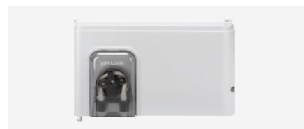
pH Link module (pH regulation)

This module automatically measures and regulates the water's pH. If necessary, corrective product is injected.