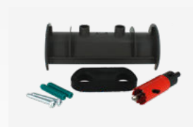
Cell Installation Kit