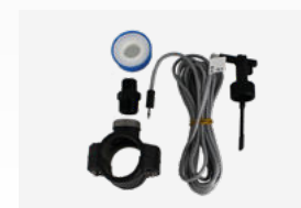
Flow switch kit