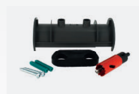
Cell installation kit for 50-mm and 63-mm hoses