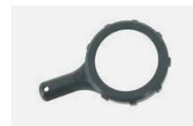
Locking ring wrench