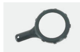
Locking ring wrench