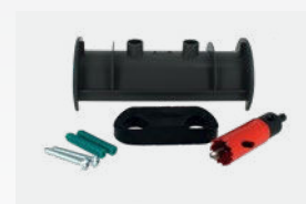
Cell installation kit for 50-mm and 63-mm hoses